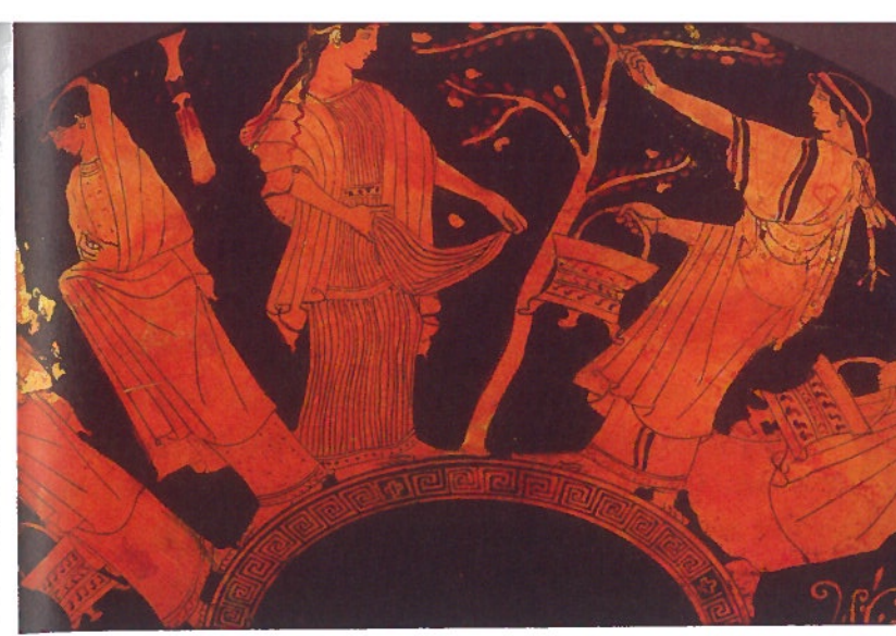
The images on this ancient Greek vase show women gathering fruit.